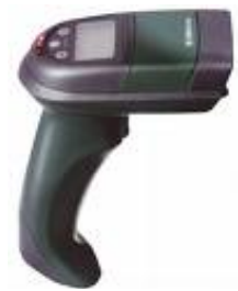
Hand Held Scanners validate all tickets, memberships and vouchers.

Rain-out or technical failure events flow all the way through the Venue reporting.