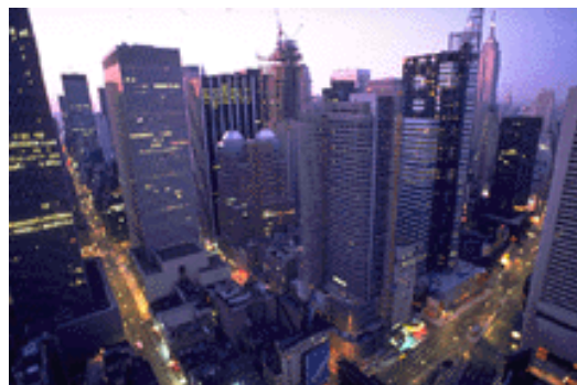
Buy tickets, any time any where, on Venue Master

different concurrent selling channels. This helps exhibitors to sell tickets over multiple channels. So if you need a new payment type to help give your business the marketing edge, please discuss it with us - chances are the basics are already in place.